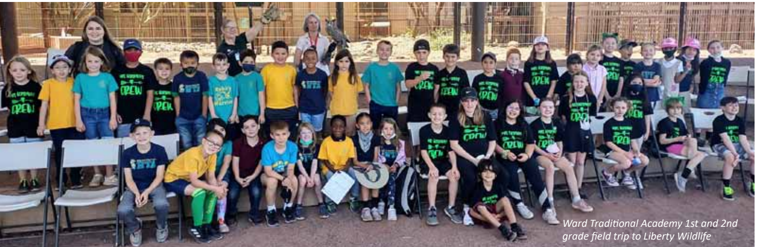
Ward Traditional Academy 1st and 2nd grade field trip to Liberty Wildlife