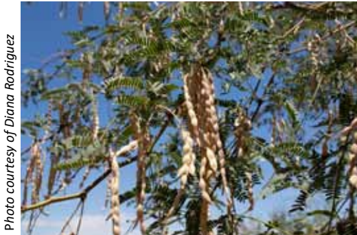
Mesquite seed pods

The saguaro cactus, the most distinguishing Sonoran plant, might not exist in this desert at all if it weren’t for these trees. In addition to the Sonoran’s perfect climate for saguaros, all three trees, but especially the palo verde, are nurse plants for the saguaro. It takes a saguaro seedling about 10 years for it to grow one inch, and about 83 years to reach 10 feet. This means the saguaros cannot reach maturity unless their seedlings have uninterrupted protection for years. Sometimes desert observers will see a mature saguaro crowding out one of these trees. That’s because the seedling was nurtured under it, but as the saguaro grew, it robbed the tree of nutrients, which sometimes will result in the tree’s death.