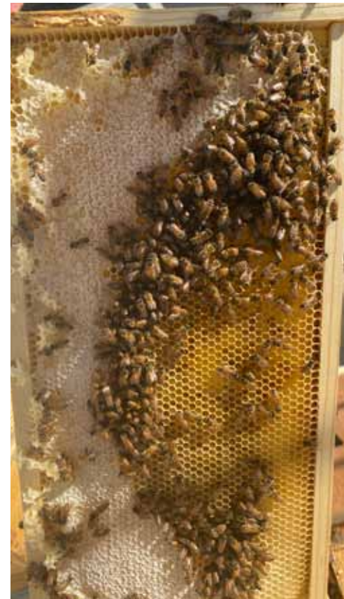
A frame of bees working on honey storage. The white section is cells that the bees have filled with honey and covered with wax. They will fill up all the cells on both sides of the frame before the beekeeper harvests the honey.