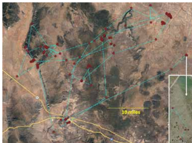
Below left: Movement track of Liberty Wildlife rehabilitated male golden eagle 121742 through May 1, 2022 evening, based on hourly GPS locations.