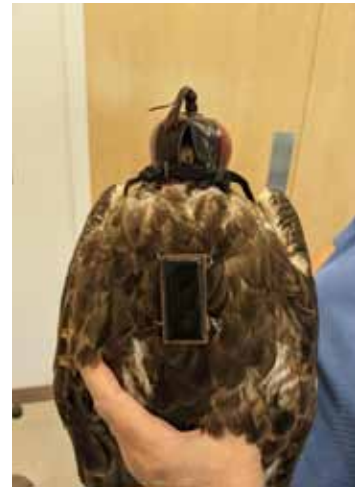
Telemetry backpack/transmitter placed on Swainson's hawk.

bird recovered, she was fitted for a backpack telemetry to monitor her movements. Swainson's hawks have one of the longest migrations of the raptor species, and they typically go down to Argentina during our winter months where they live on crickets and other prey. The Swainson's hawk did what she was expected to do once out in the wild. She hung out in the Santa Cruz Flats, where she was released, for about a month before setting off on her migratory journey. She left on October 19th and arrived in Argentina on December 5th. You can view her route on the maps below.