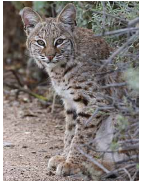
An adult bobcat in the wild

While you cannot visit him at the time of this printing, we are embarking on a plan to create some new enclosures on our education side for Bobbie, Groot and any other mammals that may end up needing to find a second life at Liberty Wildlife. So, stay tuned!