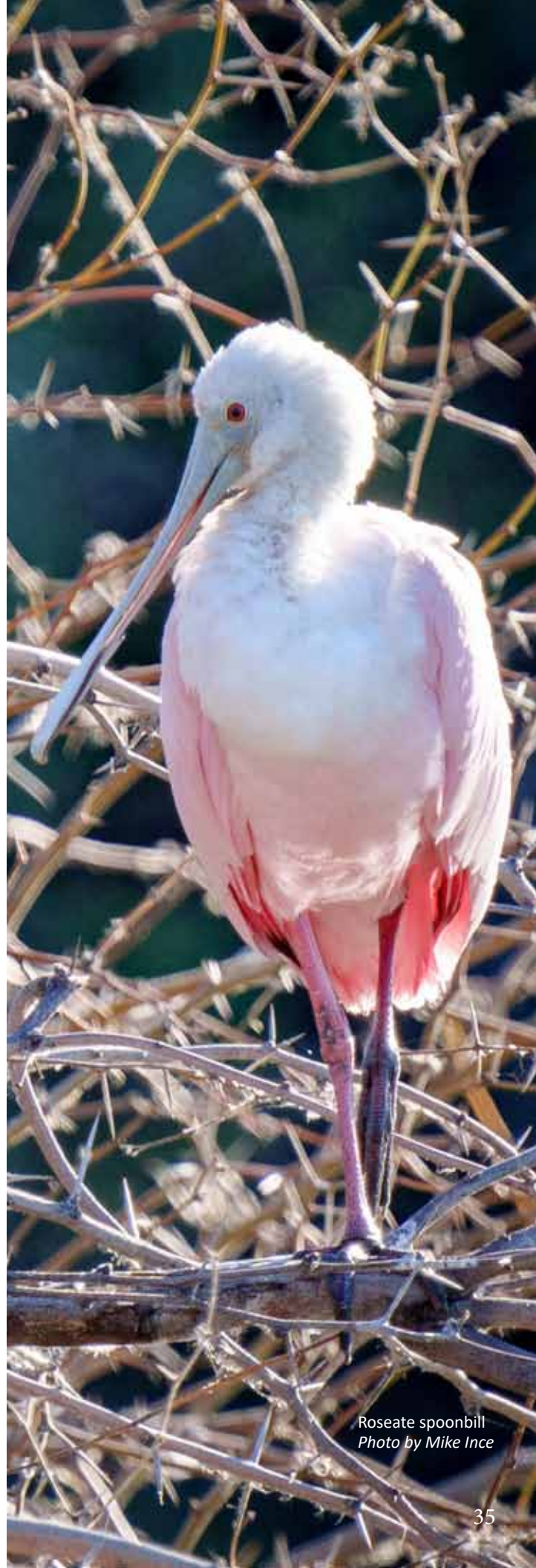
Roseate spoonbill