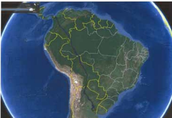
Swainson's hawk tracking January – March 2022