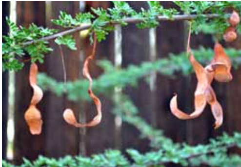
Velvet mesquite seed pods