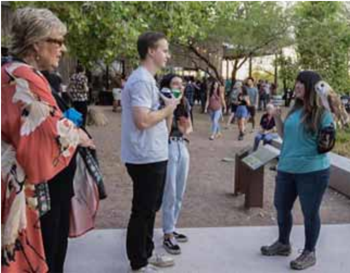
Visitors meet with Education Ambassador Henry, a barn owl, at Liberty Wildlife's Condors & Cocktails event