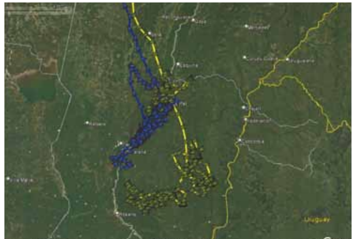
Swainson's hawk update June 14

Maps courtesy of Arizona Game & Fish Department