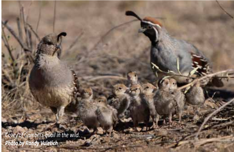
Covey of Gambel's quail in the wild.

They watch over many more young than any quail parent would have to in the wild, and they do an admirable job. We are so grateful to have Bert and Ernie, and we love seeing their young quail grow and thrive under their care.