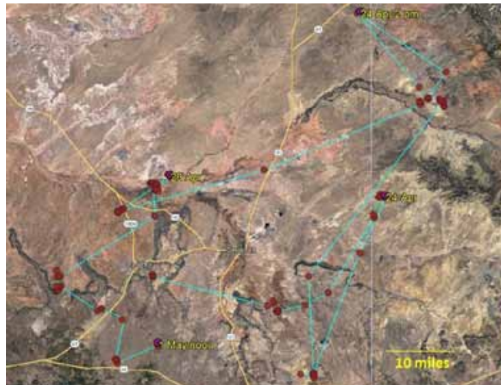
Left: Movement track of Liberty Wildlife rehabilitated female golden eagle 141728 through May 2022 noon, based on hourly GPS locations.

The key benefit Liberty Wildlife gets from all this information is knowing and having proof that rehabilitation works. We invest time, energy, and lots of care for these wonderful animals that arrive at our facility, and we see firsthand all the injuries and issues that they display. Being able to give these animals the best second chance at survival in the wild where they belong provides validation that the hard work is paying off.