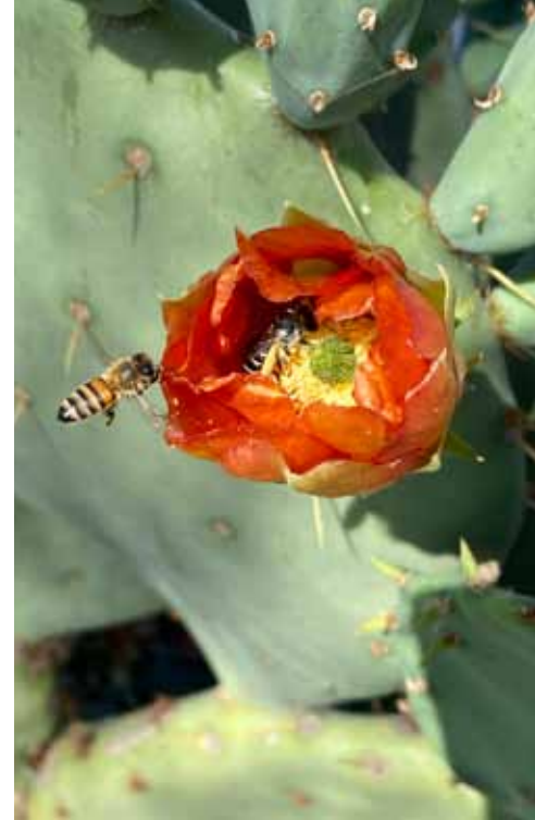
A wild native bee and Alvéole honey bee share a pollen breakfast from a prickly pear blossom at Liberty Wildlife.

If you want to follow along with the bee's journey at Liberty, you can scan the QR code to see their MyHive—it's a social media page for bees!