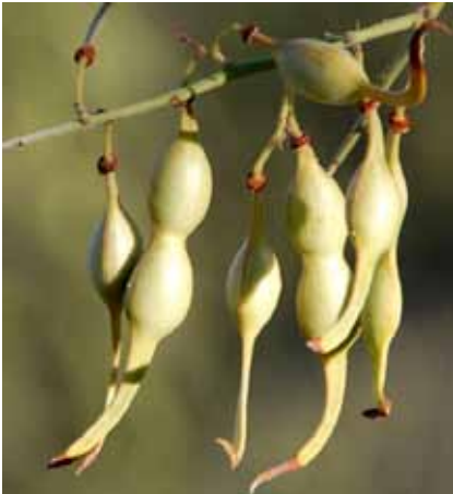
Foothills palo verde seed pods