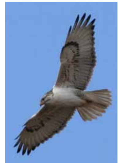
Ferruginous hawk Photo by Terry Stevens

Reprints of articles may be possible with written permission Copyright © 2022 Liberty Wildlife, Inc.