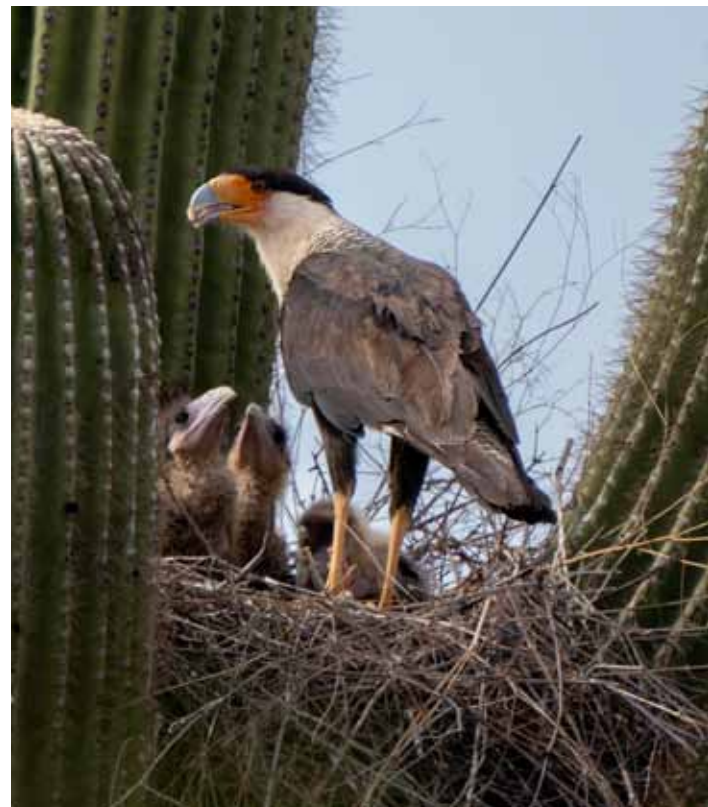
A crested caracara family in the wild

Henry David Thoreau, 19th Century American essayist, naturalist, and philosopher